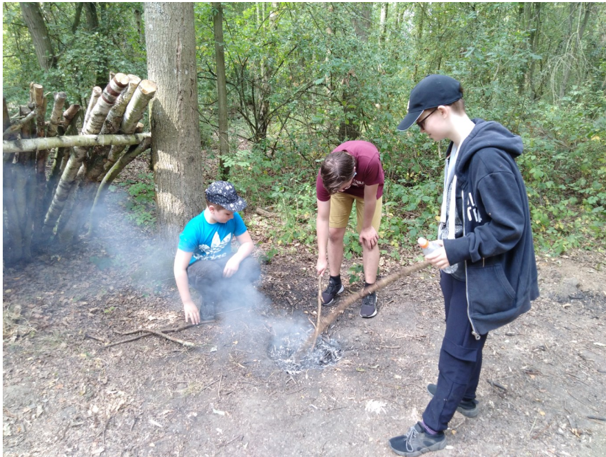
Layer Marney 2020