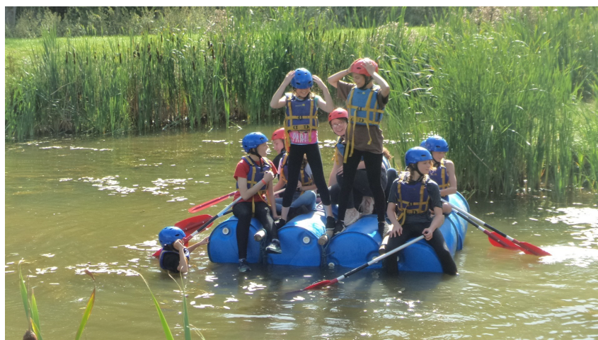
Layer Marney 2019

Along with the trips that have already been booked, we are keen to book more trips as and when we receive the funding, and upon the suggestions of the young people. Each year we normally have 3 grants from the Jack Petchey Award. The young people who are awarded have the choice of either choosing to spend the money on a trip or towards some new equipment, so no doubt we will have at least one day trip following a Jack Petchey Award.