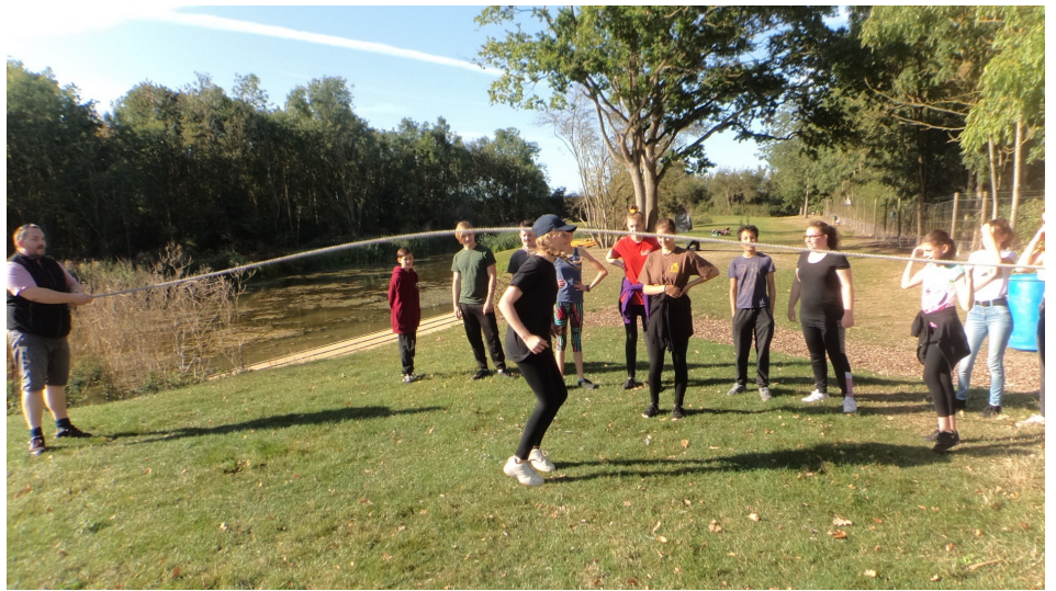
Activity day at Layer Marney.