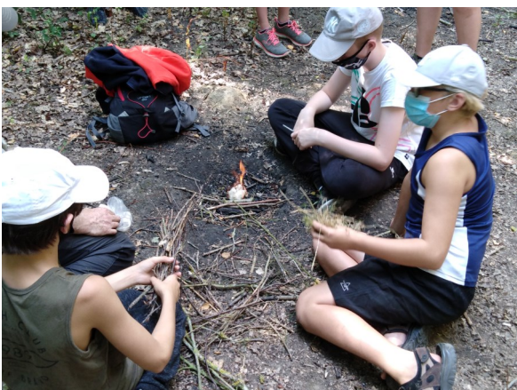
Building a fire. Layer Marney 2020

The Restricted Funds Income in the year totalled £46,359. Of this, only £16,560 was spent within the financial year, leaving £29,799 to be spent in the 2020-2021 financial year. Some of this has already been spent, in December 2020, on the refurbished toilet. The remainder will be spent as and when we can undertake normal activities.