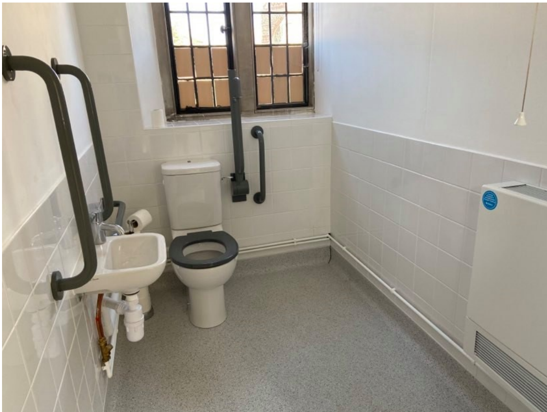
Newly installed accessible toilet