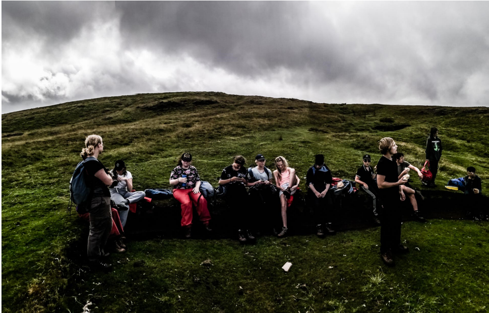
Mountain climbing in Wales.